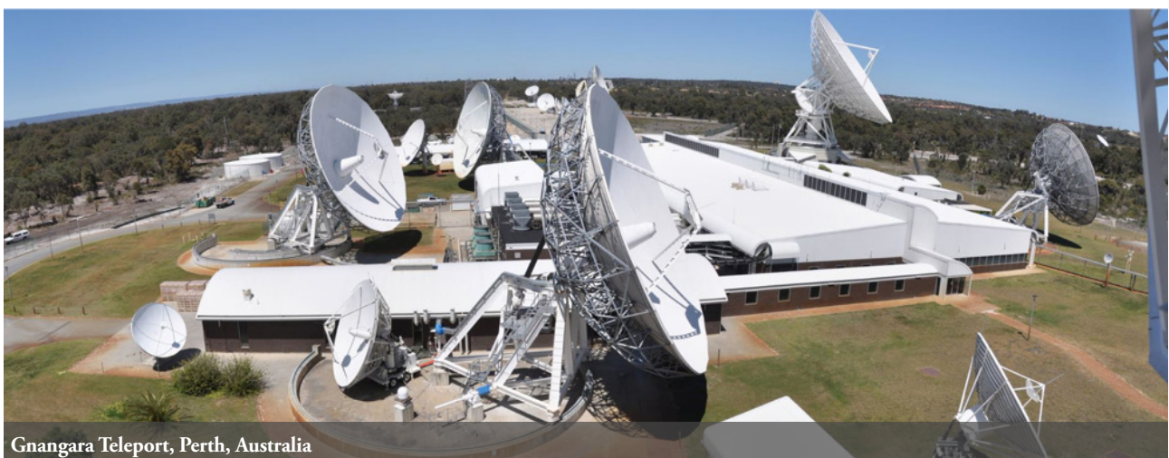
Gnamara Teleport, Perth, Australia

As satellite technology has gained further traction over the past decade, it has prompted more innovation in the industry's value chain. This has led to the development of high-throughput satellites (HTS) and swarms of LEO satellites (which sit at an altitude from hundreds to a couple of thousand kilometers), making the technology accessible to a wider range of companies and an increasing number of applications, including edge computing, IoT and more.